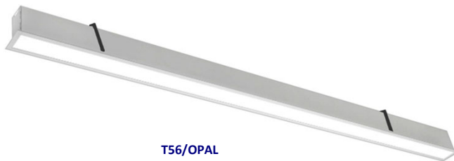
T56/OPAL Aluminum profile (39x65)