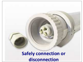
Safely connection or disconnection