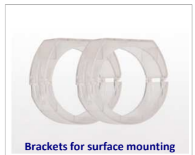
Brackets for surface mounting