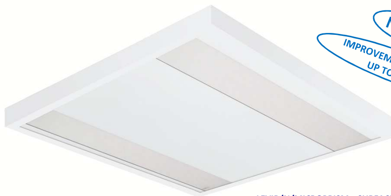
LEVIR/N/MICROPRISM + SURFACE ACCESSORY