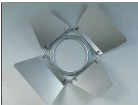
BARN DOOR BDR