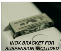
INOX BRACKET FOR SUSPENSION INCLUDED

The diffuser is fixed to the body through Anti-vandal inox clips. These have to be opened with a screw-driver or any other needle source.