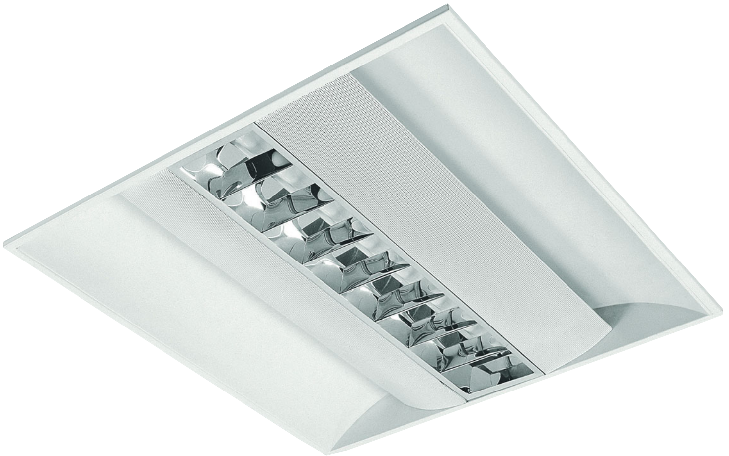
LD/BR 2x55+1x18 W.

ACCESORIES: Brackets for mounting on plasterboard ceilings and special frame.