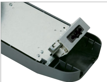
Possibility of connector wieland or similar