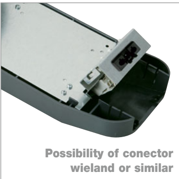
Possibility of conector wieland or similar