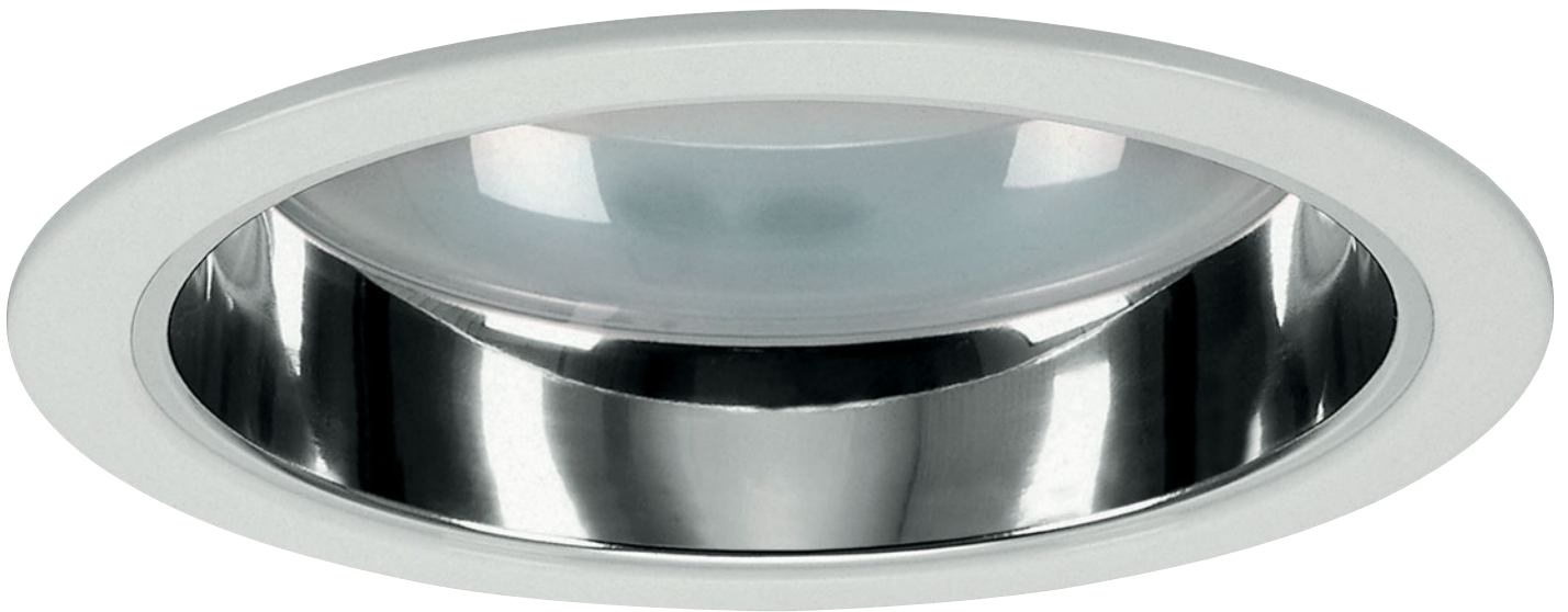
DTM-IP44-195 1x13 W.