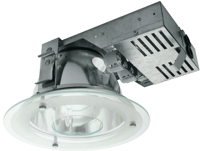
DGA-195 1x13 W.