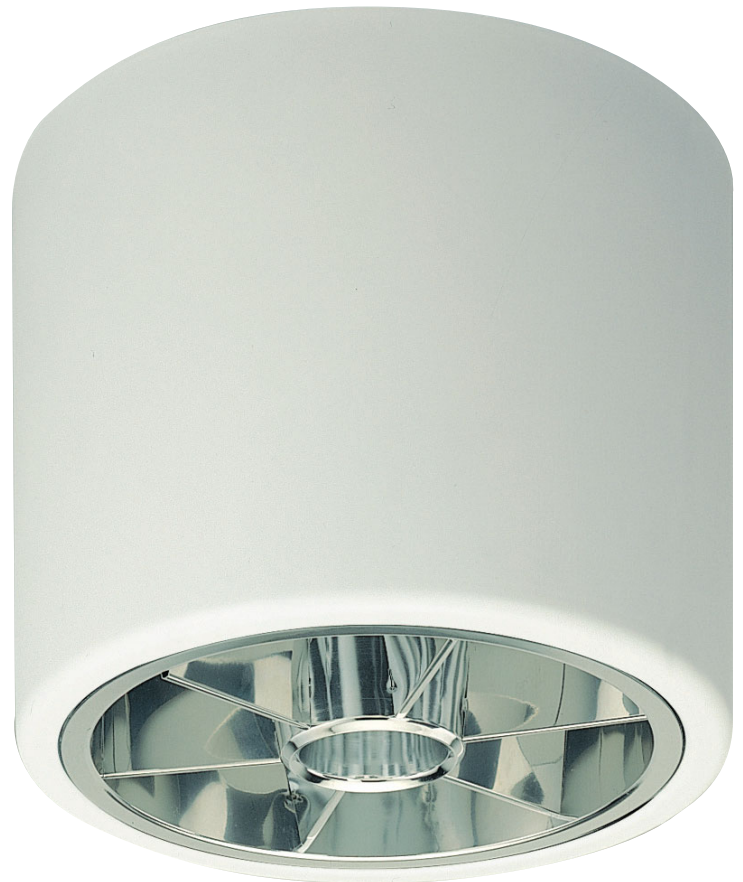
TURBO CILINDER 1x13 W.